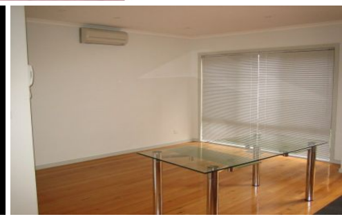
2/15 Fawkner Road PASCOE VALE VIC

Partly furnished as new 2 bedroom townhouse with polished floor baords, all modern conveniences, separate kitchen with stainless steel appliances, heating, cooling, master bedroom with ensuite and WIR, 2nd bathroom with shower, courtyard and remote lock up garage. Close to transport.