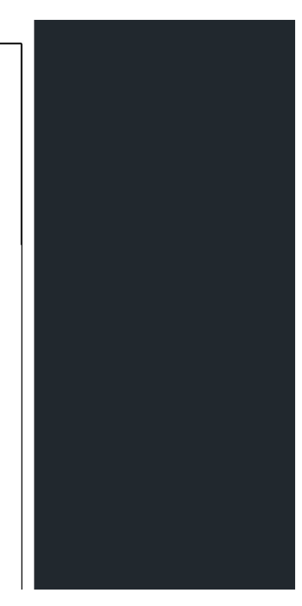
* Not in position