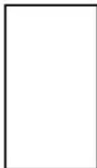
STORAGE BOX (not in position)